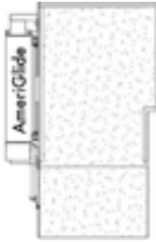
90° Left Hand