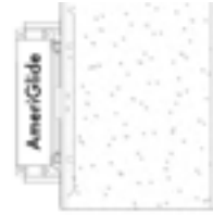
0° Inline Left Hand