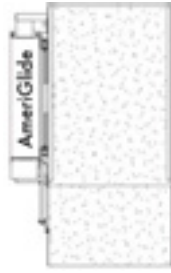
Straight Thru Left Hand