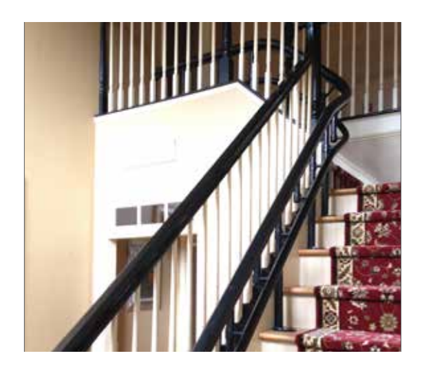
Black rail with 90° turn against the banister side of the stairs