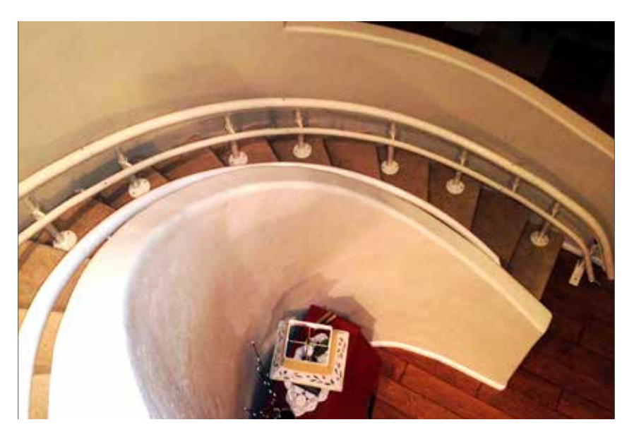
Beige rail with long sweeping turn on the wall side of the stairs