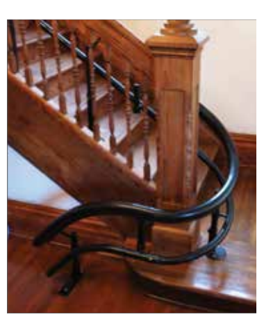
Top and Bottom Landing