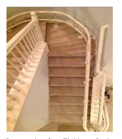
Customized to Fit Your Stairs