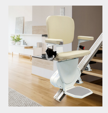
Straight Stair Lifts