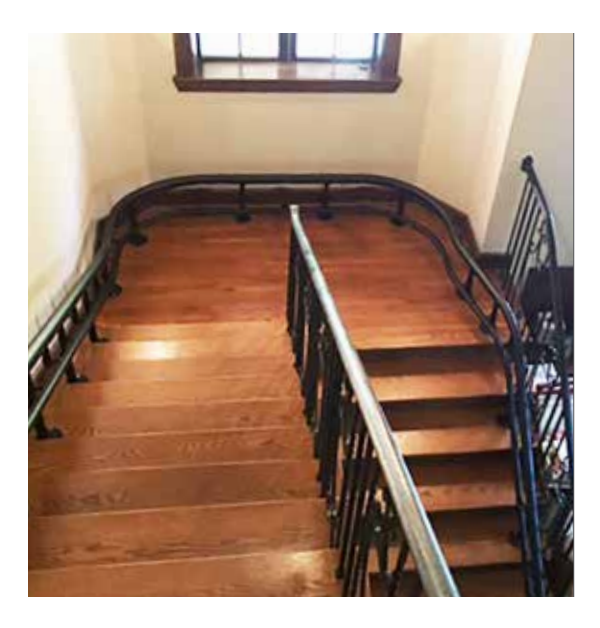
Black rail with wide 180° turn on the wall side of stairs