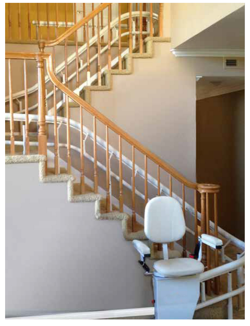
Beige rail with wide 180° turn the landing of the banister side of stairs