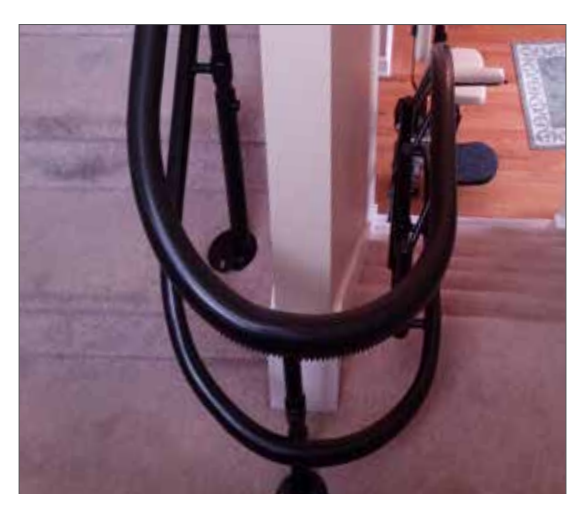
Black rail with tight 180° turn on the inside wall of stairs