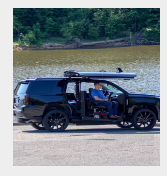
Wheelchair-Friendly Accessible Vehicles