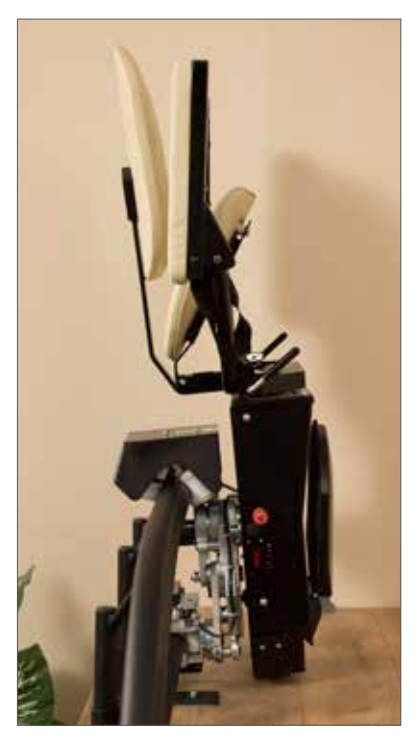
Space-saving seat folds to 16" while not in use so others can pass by.