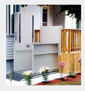
Vertical Platform Lifts