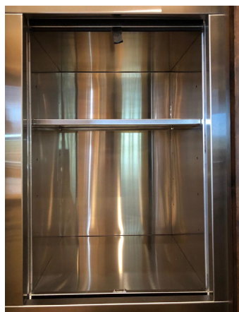
QSC-300: 304 grade stainless steel, #4 brush finish